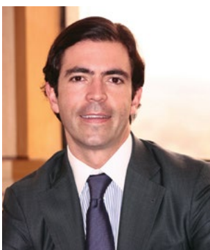
Stiernon: ticket sizes have gone up dramatically

has gone up dramatically in the last five years." Previously, large Latin American pension funds would write checks averaging $40 million to $75 million in size. However, those investors are now committing a minimum of $100 million to a fund, usually designating $125 million to $200 million per investment.